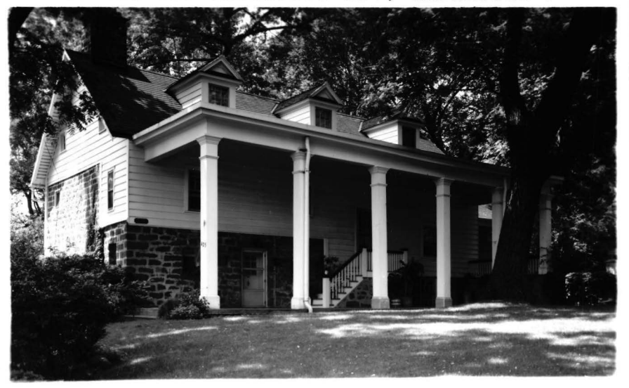
floard of Realtors of the Oranges and Maplewood